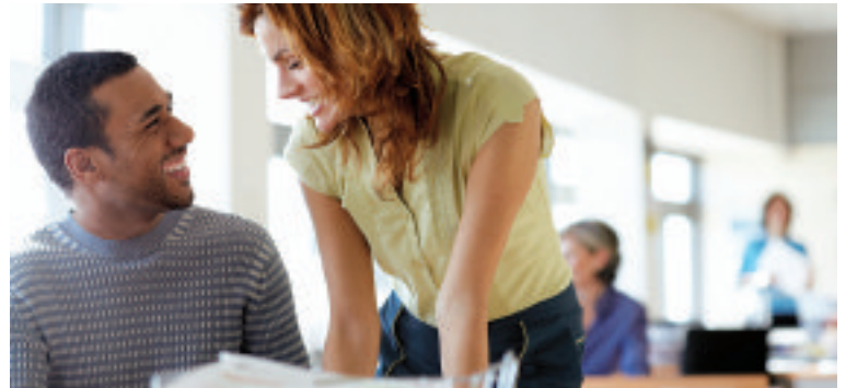
Don't be a creeper — make sure you approach a new person with an interesting, unique reason.

Invite the hot stranger and their partner (or friends!) to join you and your partner (or friends!) for drinks, a comedy show or dinner. Triads and quads keep things light and provide a higher number of possible conversation combinations and permutations. It's the platonic version of threesomes and swinging.